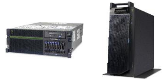
Power 720 Express 4-core